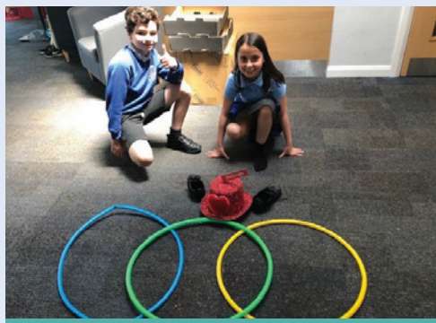
Activities help Charlie and Lucy learn about brain injury.

Schoolchildren do so much to raise funds for us. So we set up a virtual School Recognition Day, to show them just how much their support means.