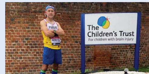
The Virtual Virgin Money London Marathon.

Take part in the world's greatest marathon on a course of your choice during a 24-hour period. Guarantee your spot on your virtual start line by joining our Squad and running for The Children's Trust.