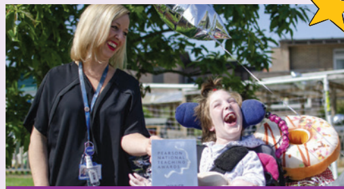
The Children's Trust School opened in 1985 and is co-located with our specialist rehabilitation centre.

The school has been here for over 35 years and we have some very exciting plans for the site, which are currently at planning permission stage. We will share more news in future editions of inspire .